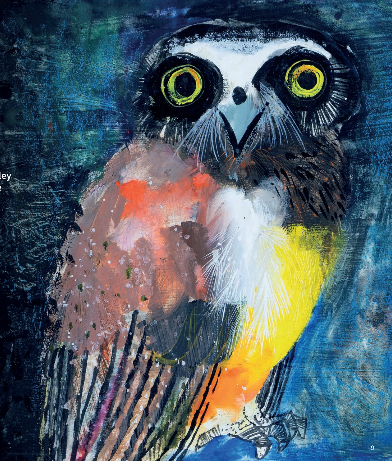
Image credit: A stare of owls – paws, claws, tails and roars © The Brian Wildsmith Estate, 2024. Reproduced with permission of The Brian Wildsmith Estate and Oxford University Press.

For the first time Brian's personal collection of over 40 colourful original illustrations, early works, drawings and paintings will be on display in the beautiful setting of the Cooper Gallery. The walls will be filled with colour and vivid characters. It's a perfect destination for art lovers of all ages.